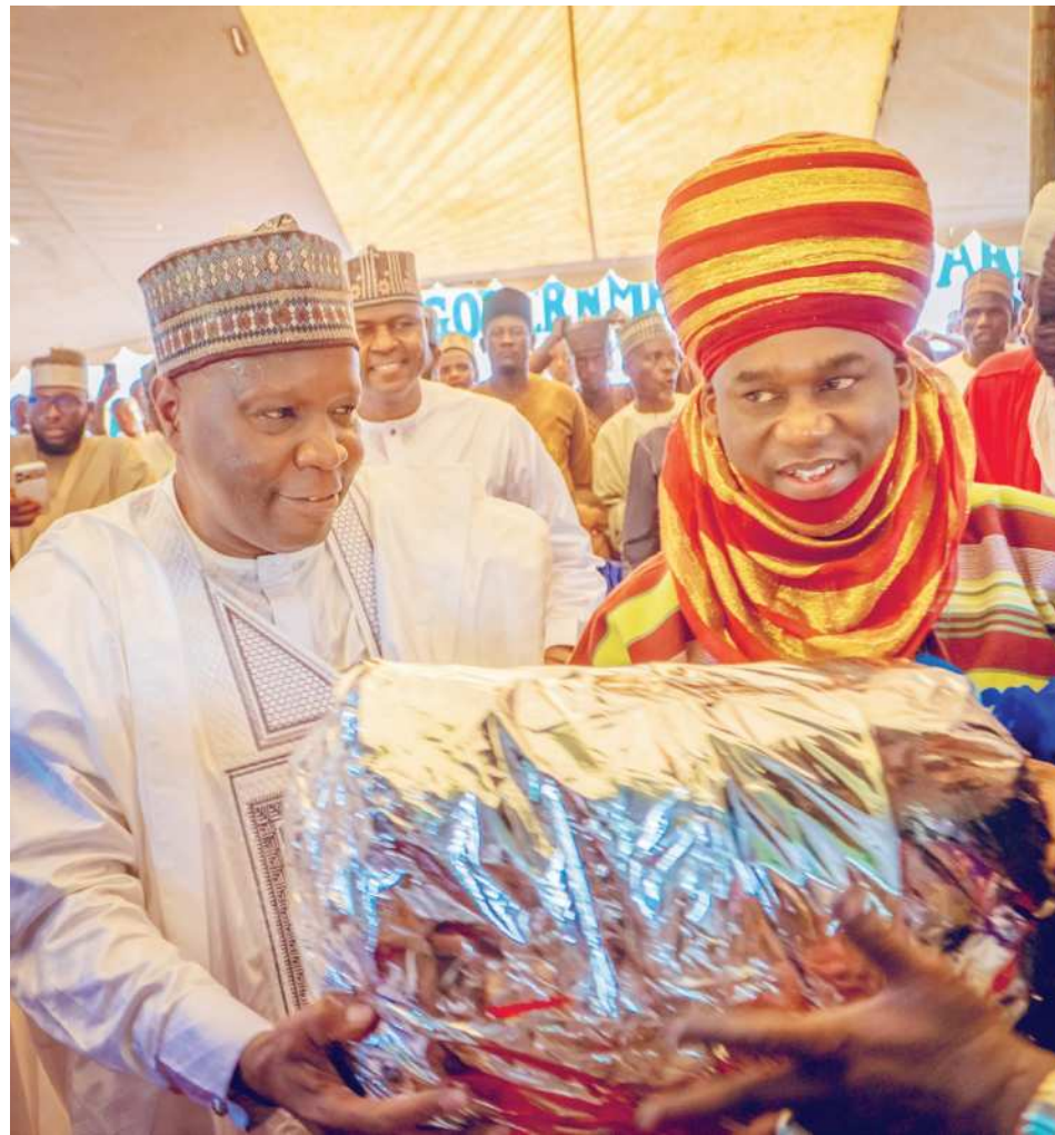
Gombe state Governor Muhammadu Inuwa Yahaya (left) presenting a gift to Emir of Gombe, His Royal Highness Alhaji Abubakar Shehu Abubakar III, during the Emir's traditional Sallah homage, at the Government House in Gombe Friday

"Anybody from another state who is trying to destroy Rivers state, the person will have problems. You put your hand, you get fire," he stated.