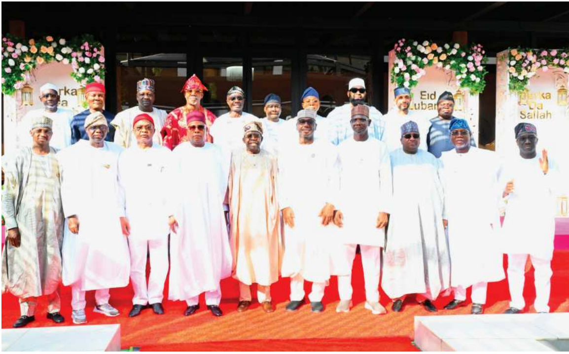
President Bola Ahmed Tinubu (5th left), Vice President Kashim Shettima (4th left), with the governors led by the Chairman Nigeria Governors' Forum (NGF), Governor Abdulrahman Abdulrazak of Kwara state (5th right), during a salah homage to the president at his Ikoyi residence in Lagos recently